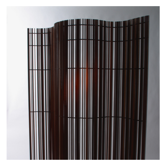
Materials: Tasmanian Oak. Dimensions: 2500 x 2000mm

I aim to design objects that are appealing on different levels; pieces that people will enjoy relating to and using. They need to be beautiful, useful, and perform the task for which they were designed, well. The Barcode screen reflects this philosophy